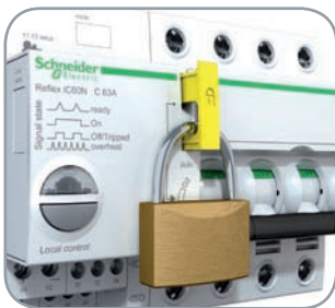
Integrated padlocking device for complete safety and lockdown capabilities