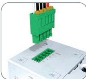
Isolated Ti24 interface connects directly to PLC to save wiring and space